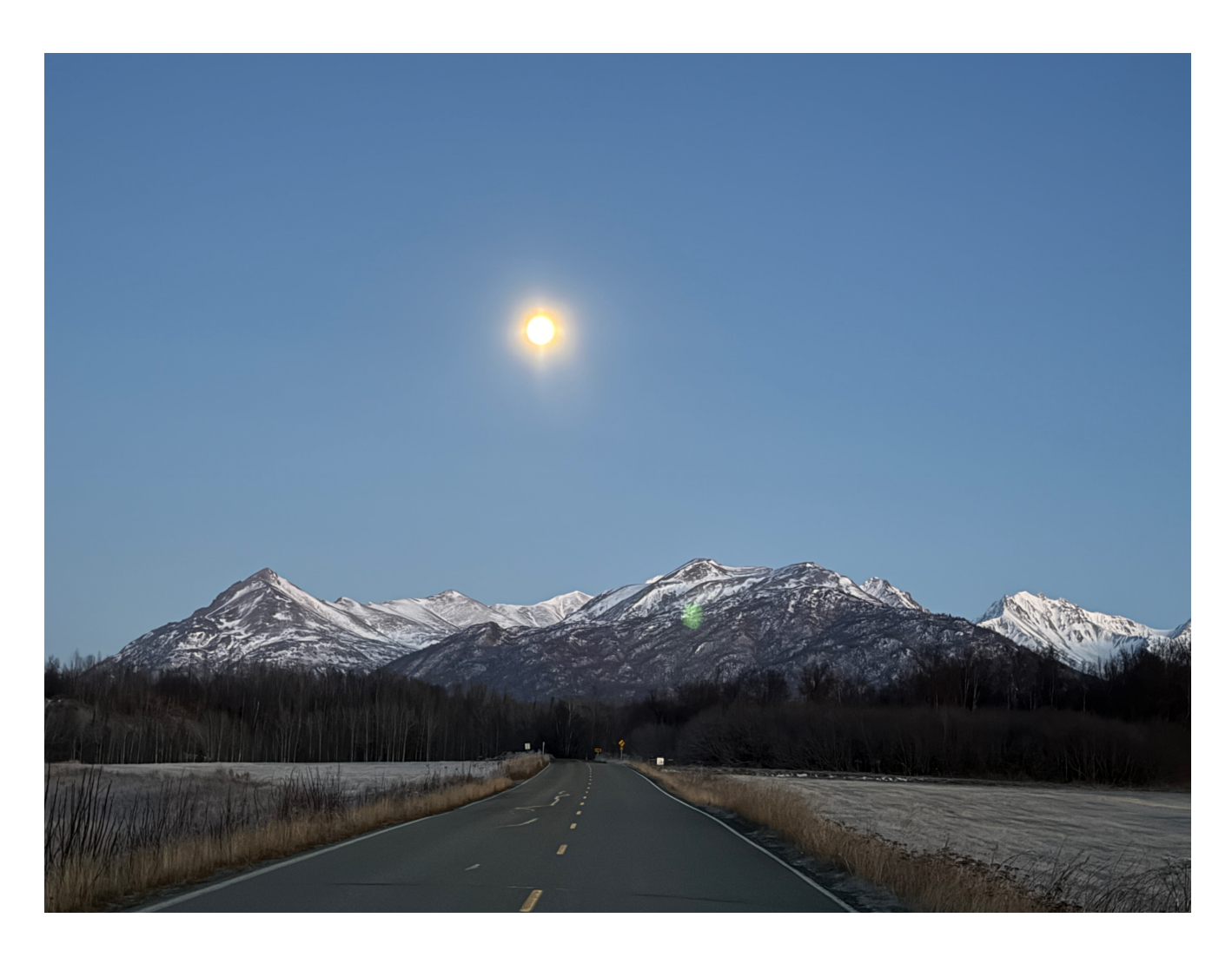
The sun peeking over the mountain in November.