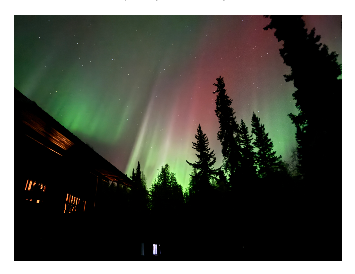
Northern Lights viewed from our home in September 2024.