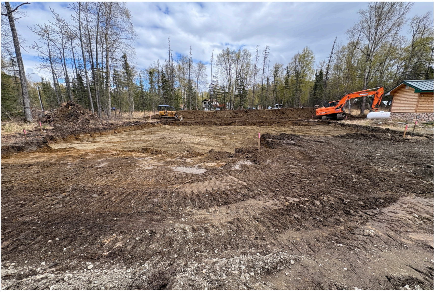
Lots of ground work being prepped before the teams start arriving.