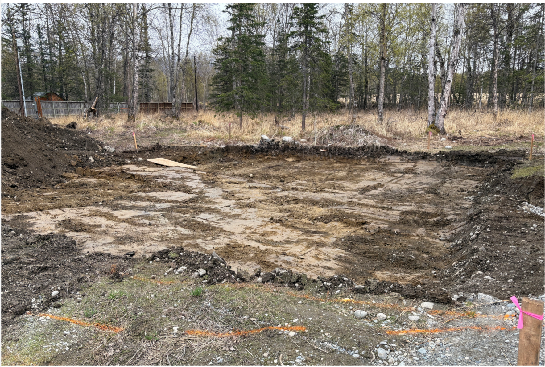
Getting the area prepared for stone for the garage.