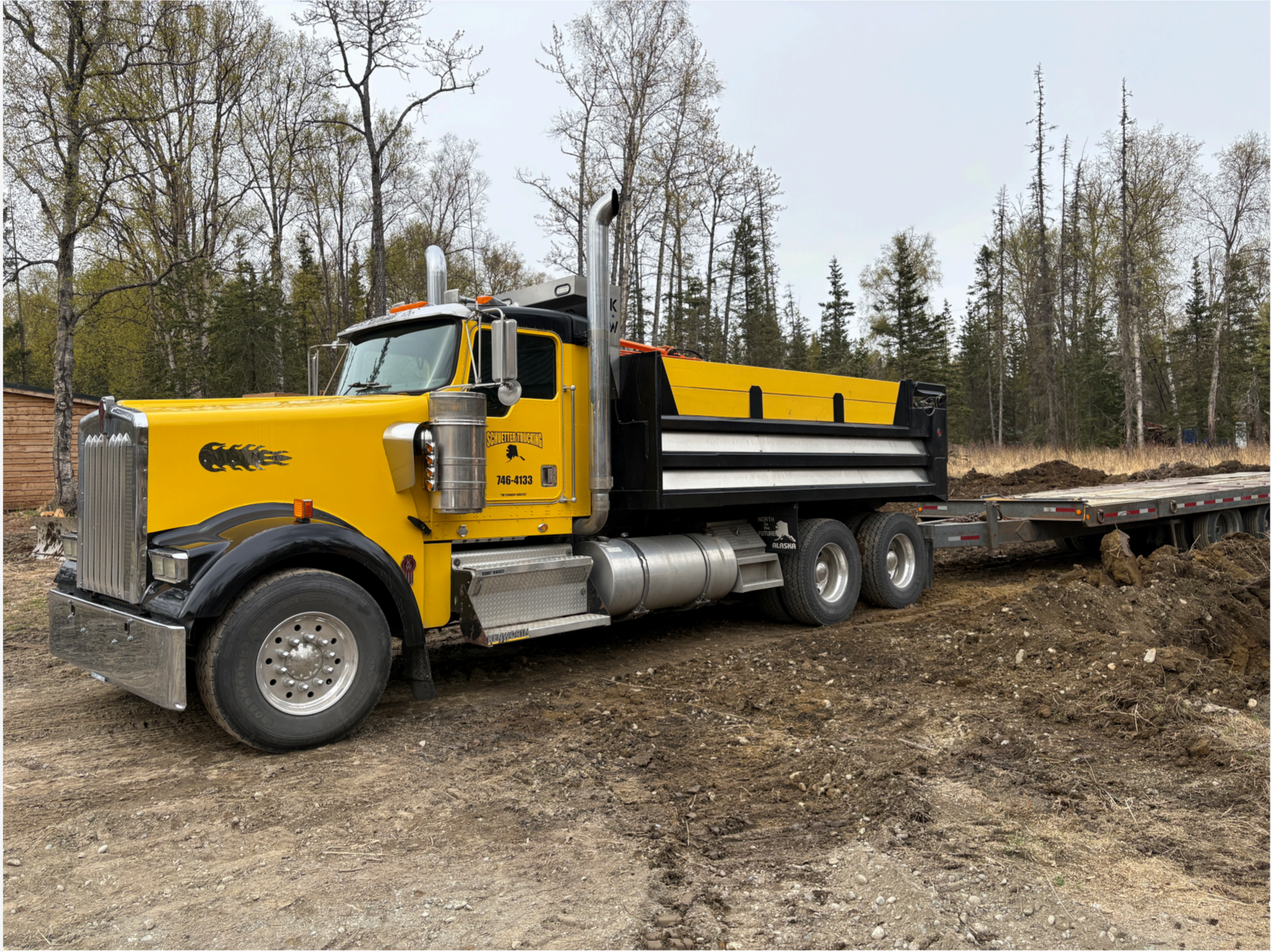
Truck used to haul in the equipment to prepare the land for the garage.